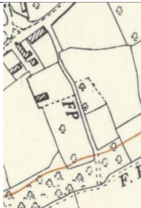
1:10,560. ST92NE - A. Surveyed / Revised: Pre-1930 to 1961, Published: 1961