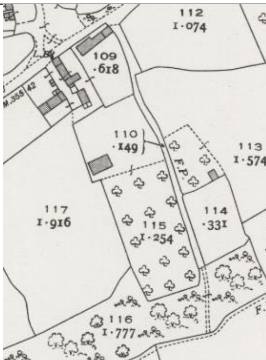
25-inch. Wiltshire LXV.13. Revised: 1939, Published: 1947