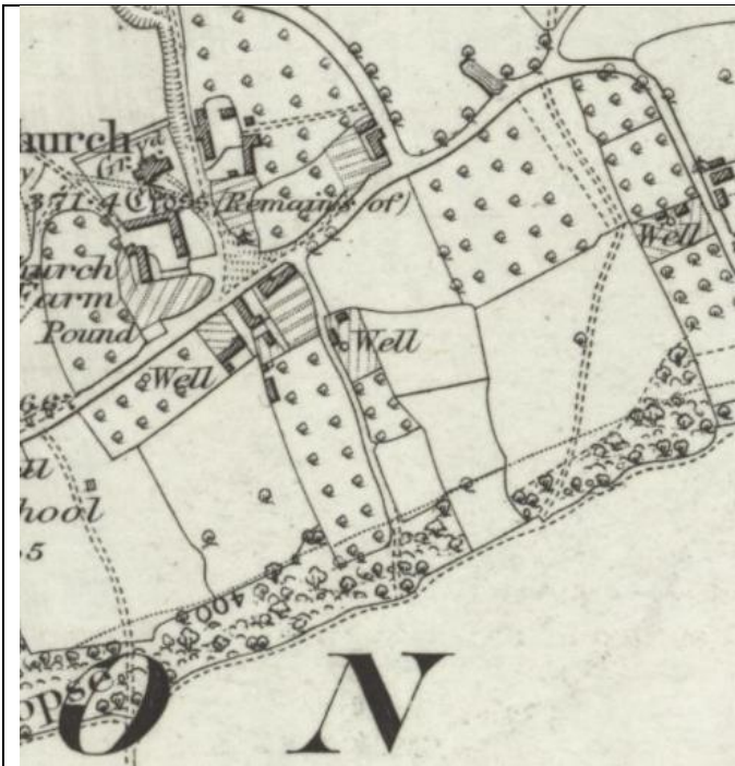
Six-inch. Wiltshire Sheet LXV. Surveyed: 1886, Published: 1890